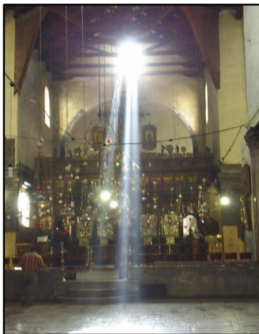
Church of the Nativity Bethlehem