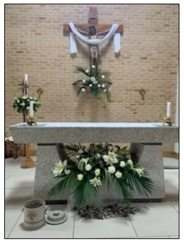
St. Felix Church 'dressed' to celebrate the Lord's Resurrection with thanks to our talented flower arrangers.