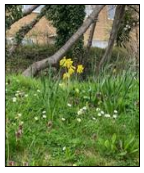
Cowslips, daisies and clover in our 'wild flower meadow' and our new trees checking out conditions beyond their protective cover.