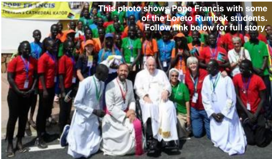
This photo shows Pope Francis with some of the Loreto Rumbek students. Follow link below for full story.

https://www.ncregister.com/cna/loreto-sister-meeting-pope-francis-a-dream-come-true-for-south-sudanese-youth