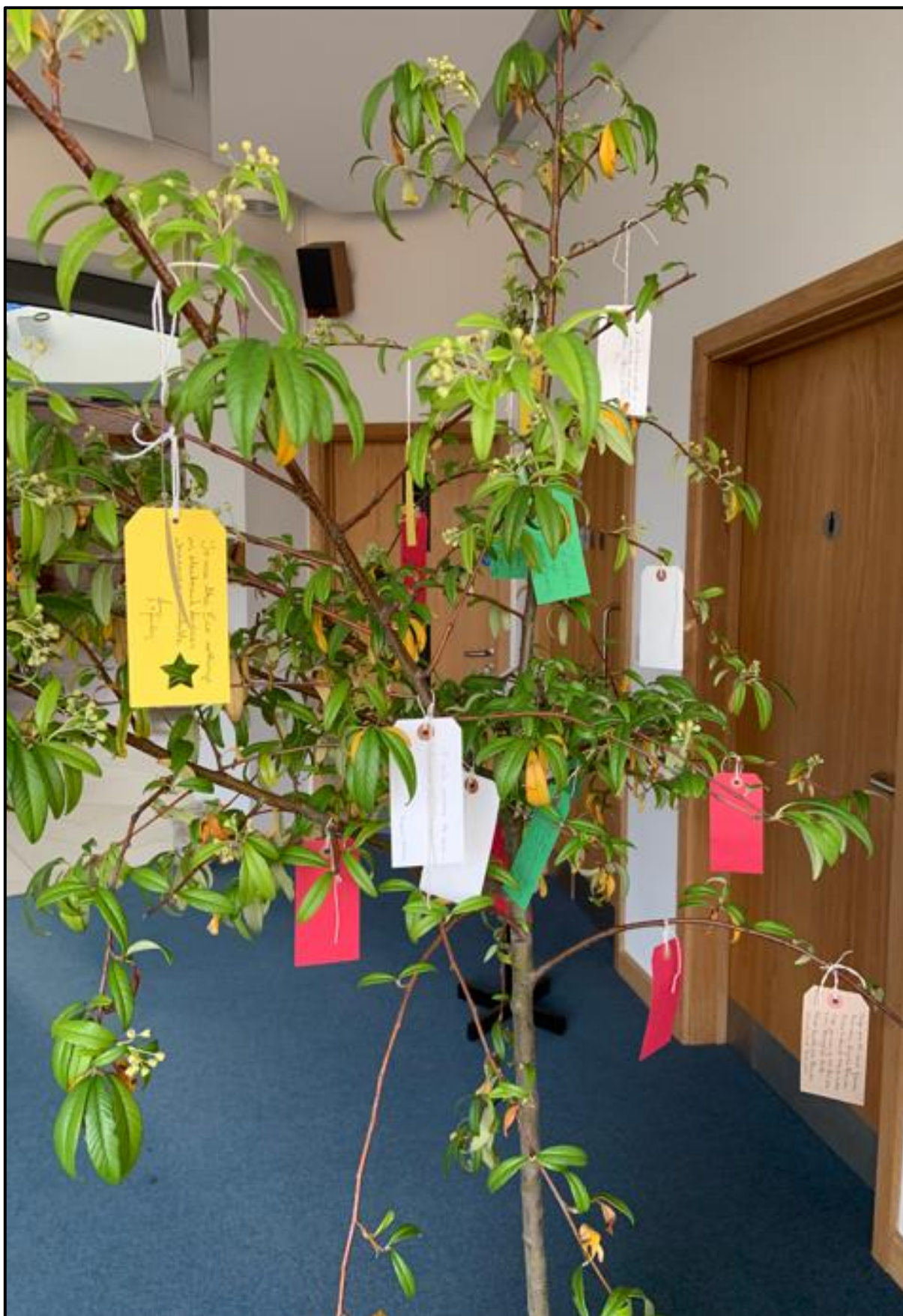
St Felix 'Tree of Promises'