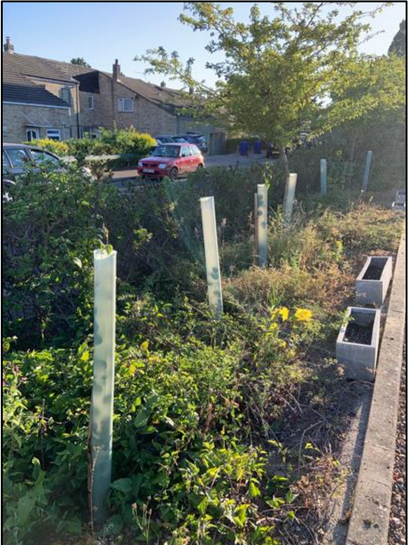
Six Crab Apple trees planted in the grounds of St Felix Church as part of 'Queen's Canopy' - spring 2022 Seventh tree planted in garden of parish house.