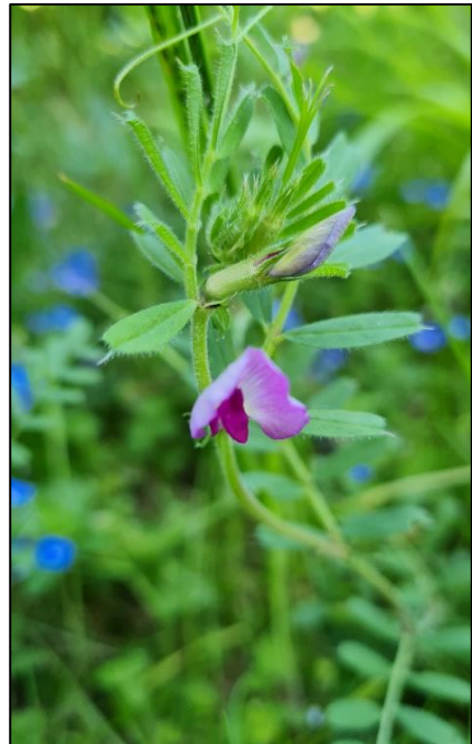
Bluebells and Common Vetch